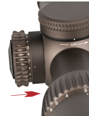
Push Illumination Dial in to set intensity level.