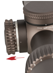
Pull Illumination Dial out to adjust intensity level.

The illumination dial allows for 11 levels of brightness intensity; an off click between each level allows the shooter to turn the illumination off and return to a favored intensity level with just one click.