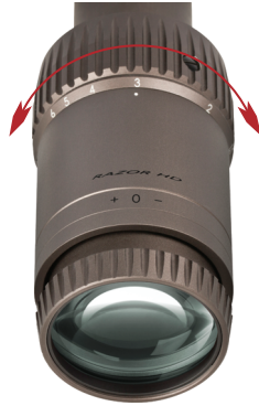
Rotate ring to adjust the magnification.