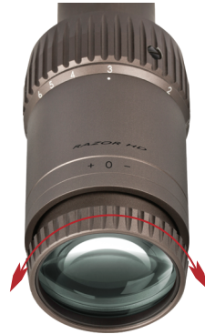
Rotate ring to adjust the reticle focus.

Looking directly at the sun through a rifle scope, or any optical instrument, can cause severe and permanent damage to your eyesight.